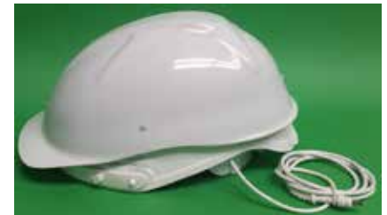
Hard Hat assembled to Helmet