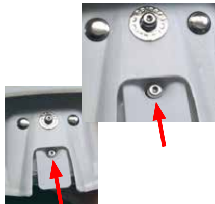
4. Continue downward movement of the Hard Hat until its T-Tab hole snaps securely on the Helmet snap.