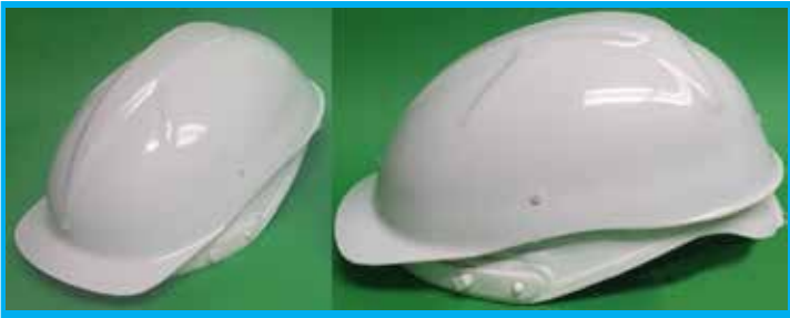
O.N. 2061-04A P/N 01031528

Before use, refer to the CAPR ® User's Instructions, P/N 03521015 (received with all CAPR Helmets) for System Details, and to the 2073-03 Hard Hat Helmet Instructions For Use, P/N 01023568.