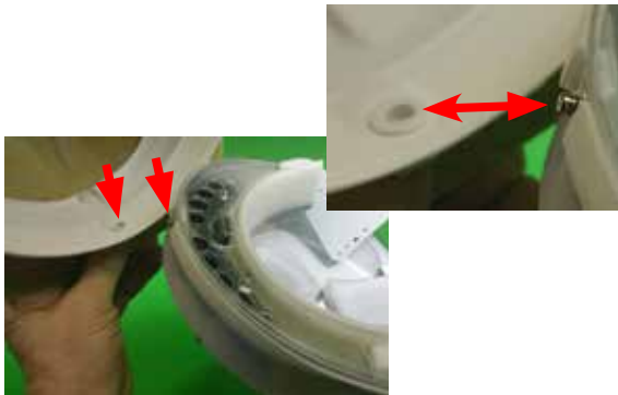
1. Locate the inside hole in the Hard Hat front Turn Clip, and the Helmet front Snap.