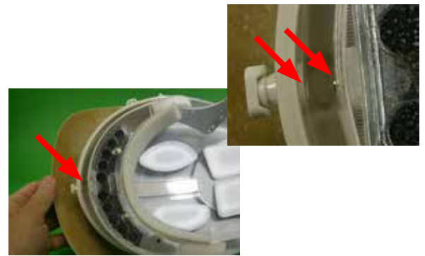
2. Place the Helmet front snap securely in the Hard Hat front Turn Clip inside hole.